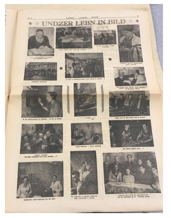
Figure 4: Yiddish camp newspaper "A Heim", 1946, page "camp chronicle". Headlines: "elections of new camp administration", "announcements"

Figure 5: Yiddish camp newspaper "A Heim", 1946, page "Our life in pictures", photos from camp life. [both: UN Archives, Area Team 1062-Augsburg-Copies of Newspaper A Heim Published in Leipheim Camps, S-0436-0009-01]